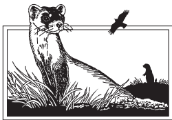
BLACK-FOOTED FERRET RECOVERY IMPLEMENTATION TEAM